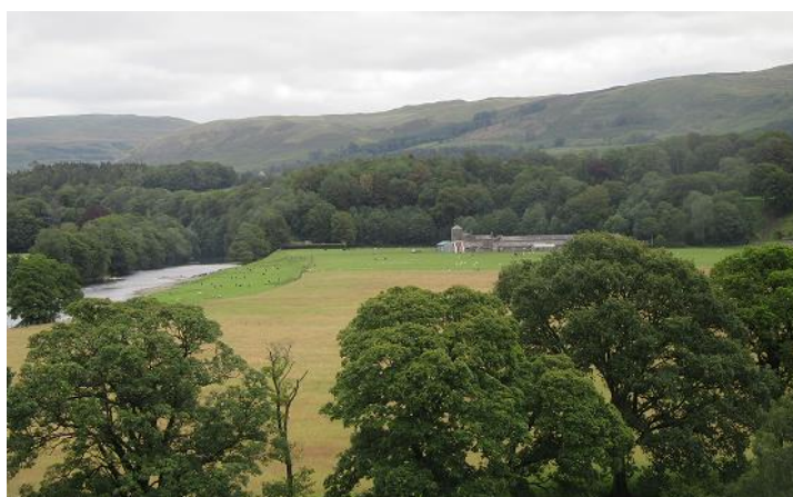
Kirfitt Hall Farm in Casterton from Ruskin's View

I have been able to continue with research on the townships around Kirkby Lonsdale, utilising websites such as archive.org and the Heritage Gateway, as well as taking the time to explore online catalogues and examine photographs of documents taken before lockdown. On nicer days since restrictions eased, I have also left my desk and made some site visits.