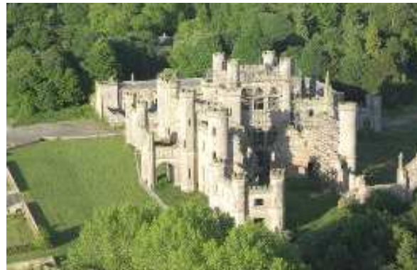
G, Lowther, Lowther Castle 2010