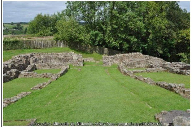
12 - Milecastle 48 Poltross Burn