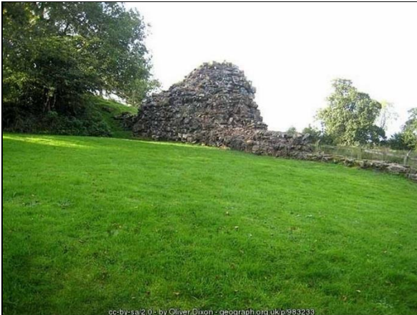
1 - Hare Hall fragment of wall

1