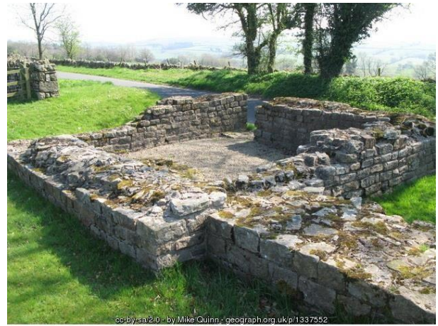
4 - Leahill Turret 51b