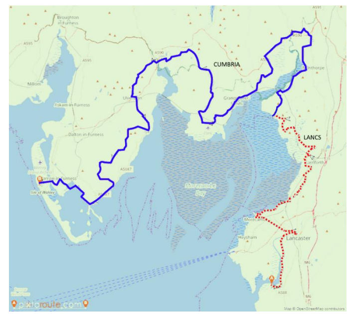
Places of interest (in Cumbria)

Morecambe Bay Cycleway : (mainly NR 100) opened in 2015, runs 81 miles around the coast of Morecambe Bay from Walney to Glasson Dock south of Lancaster – the last few miles being in Lancashire.