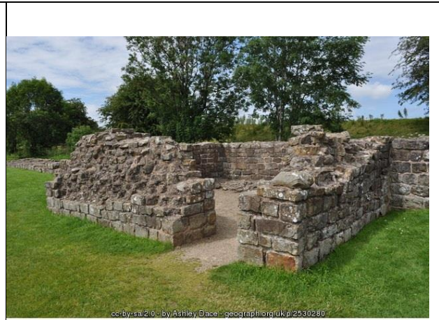
2 - Banks Turret 52A