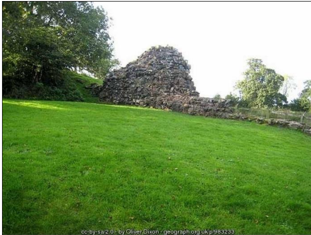
1 - Hare Hall fragment of wall

1