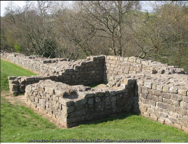
11 - Willowford East Turret 48a