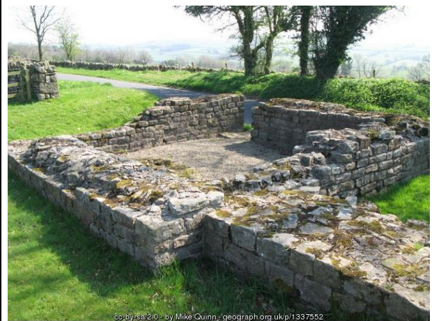
4 - Leahill Turret 51b