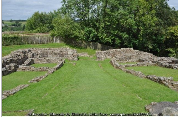
12 - Milecastle 48 Poltross Burn