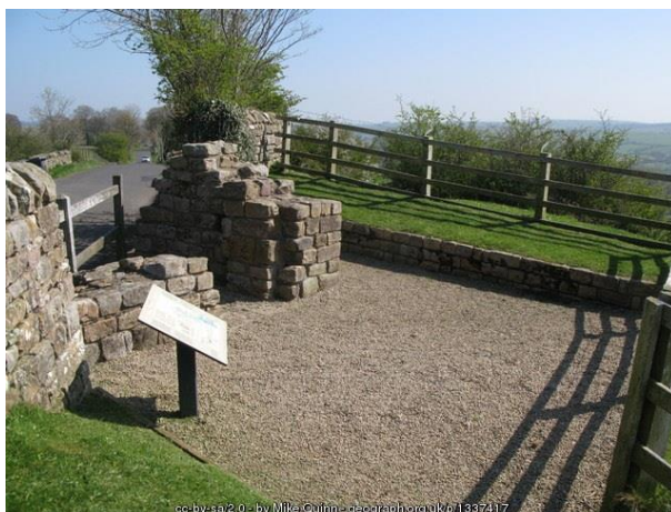
3 Pike Hill Signal station