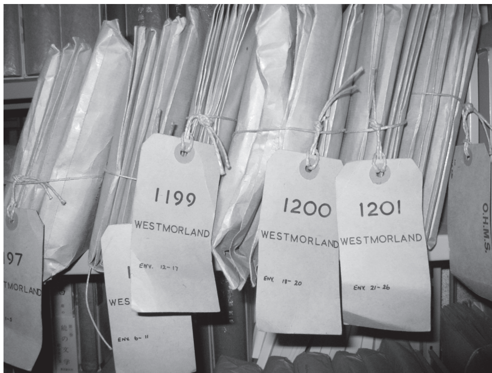
FIG. 3. VCH Westmorland slips at Egham in 2010.