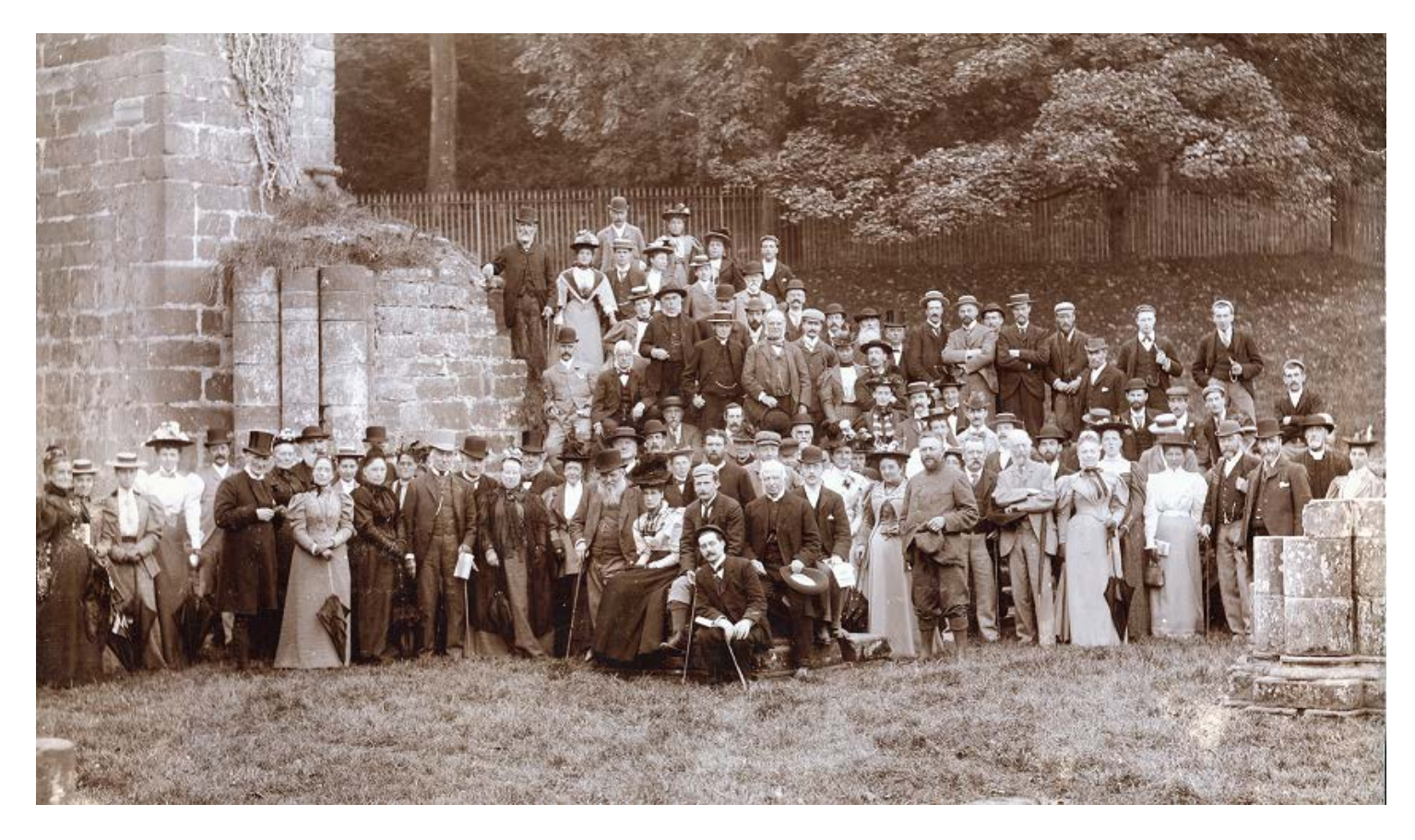
CWAAS outing to Furness Abbey, September 1895