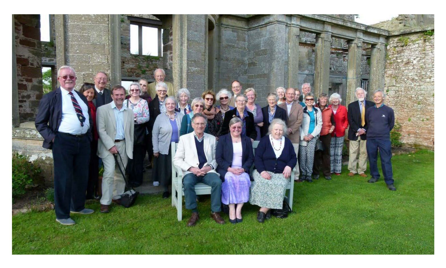
Some CWAAS members at Kirklinton, June 2015