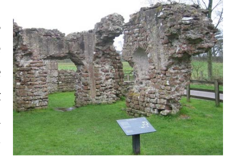
Roman bath-house at Ravenglass

lunch and a special Anniversary treat in the Castle grounds. After lunch we inspect the exterior of the Castle, which has been in the Pennington name since the 13th century; the pele tower is 14th century, later much enlarged, and the whole remodelled well by Salvin later in the 19th century. From it we walk through pleasant countryside to Muncaster Mill station where we catch the Ravenglass and Eskdale narrowgauge steam-railway back to Ravenglass. **No booking required; fare payable**